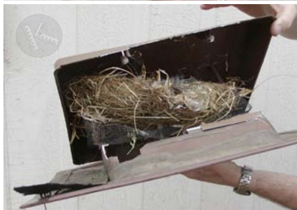
Look inside to see things are not great.