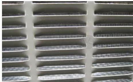
Up close look at the metal louvers